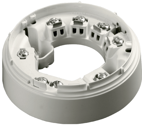
Orbis Marine Relay Base dimensions