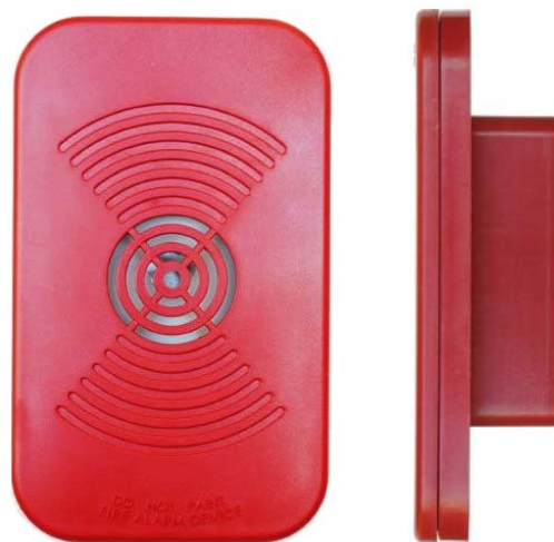
Red Mini-Horn, Front and Side View

Canadian two-stage alarm applications. A second switch position allows the SmartSync March Time pattern input to be selected as either 60 BPM or 20 BPM. 20 BPM is typically required for Canadian two-stage alarm applications as the pre-signal, followed by the Temporal Pattern. Two-stage alarm operation requires a 4010 or 4100U as the control panel.